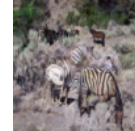
P_{0.5}(w, f) \rightarrow Q_{12}(w, f)