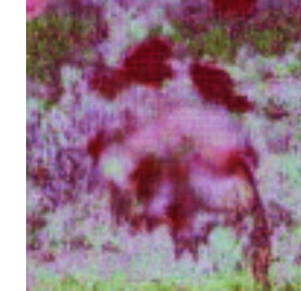
P_{0.5}(w) \rightarrow Q_8(w, f)