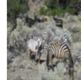
Q_{12}(w, f) \rightarrow P_{0.5}(w, f)